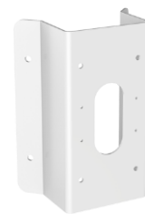
DS-1476ZJ-SUS Corner Mount