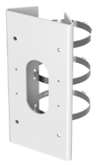
DS-1475ZJ-SUS Vertical Pole Mount